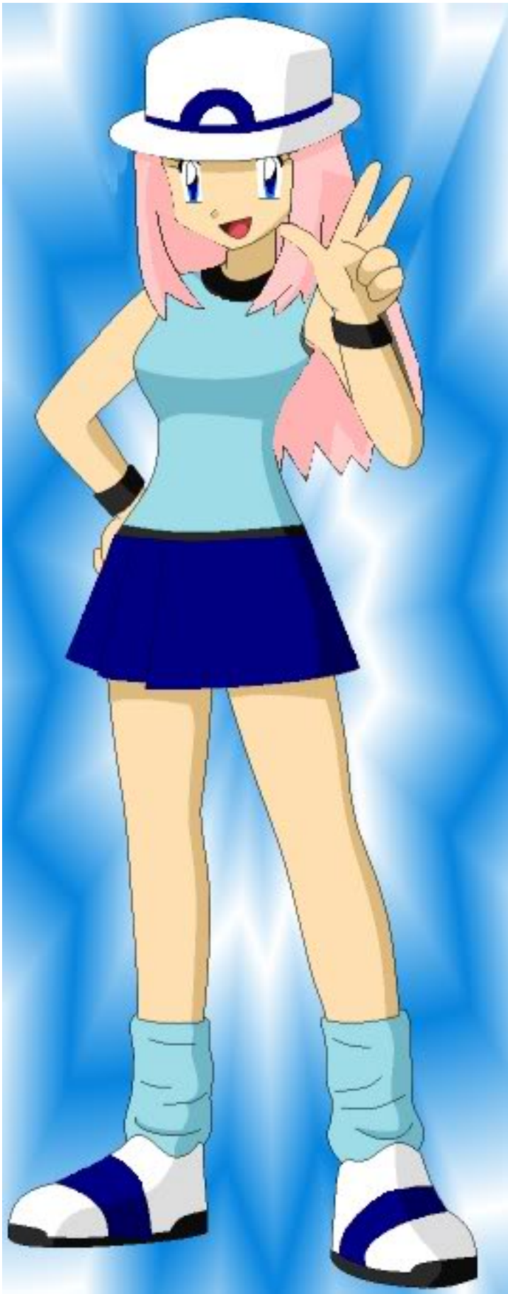
Height: A little short for her age